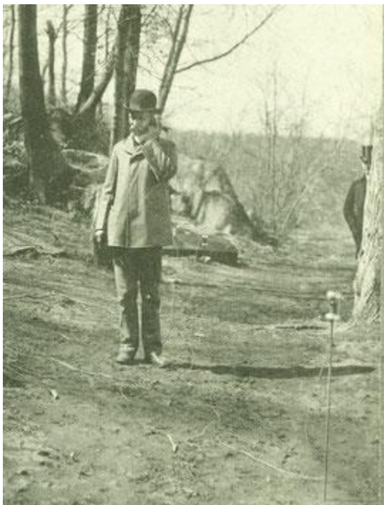
Nathan Stubblefield, receiving messages by Wireless

Other researchers corroborated the fact that usable amounts of current could actually be derived from the ground, currents whose powerful displays permitted the elimination of battery cups and generators. The failure of all reductive electrical models to satisfactorily address these energetic characteristics became especially evident with the development of the “earth batteries”, an outgrowth of these telegraphic observations (Bain, 1849). These simple material composites, made to be buried in earth, produced currents not explained through electrolytic action. Small buried earth batteries developed sufficient power to charge storage batteries. They were also employed to provide telegraphic (Bryan, Cerpoux, Dieckmann, Jacques, Bear), and later telephonic systems (Stubblefield, Strong, Brown, Tomkins, Lockwood) with uninterrupted operating power. Neither decomposing nor failing with months of buried use, the mysterious earth batteries contain an essential mystery which electrodynamic models cannot adequately explain.